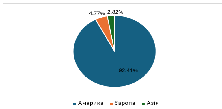
Figure 1. The structure of “brightfin's” client base by part of the world.

3. Place. Since a large number of international companies are headquartered in the United States, “brightfin” is mainly focused on the North American market (Williams Sonoma, Ardent, Hess, etc.), although part of its client base is located in Europe (Volkswagen, Henkel, Siemens, etc.) and Asia (Nissan, etc.). Figure 1 shows the structure of “brightfin's” client base by part of the world.