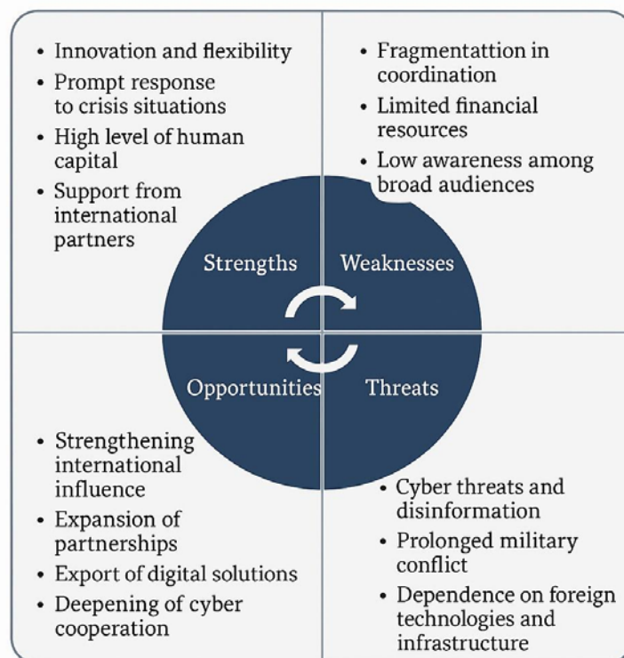
Fig. 1. SWOT Analysis of Ukraine's Digital Diplomacy

In order to assess Ukraine's digital diplomacy more comprehensively and identify its strengths and weaknesses, the authors conducted a SWOT analysis of Ukraine's digital diplomacy (Figure 1).